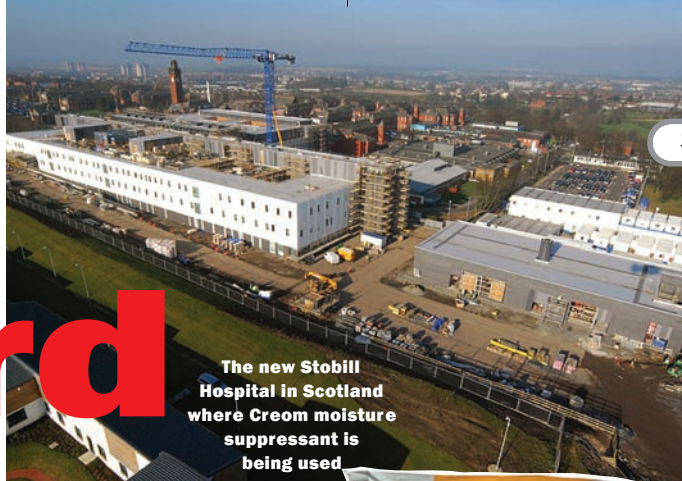
The new Stobhill Hospital in Scotland where Creom moisture suppressant is being used

Floorwise has developed subfloor preparation products designed to work harmoniously