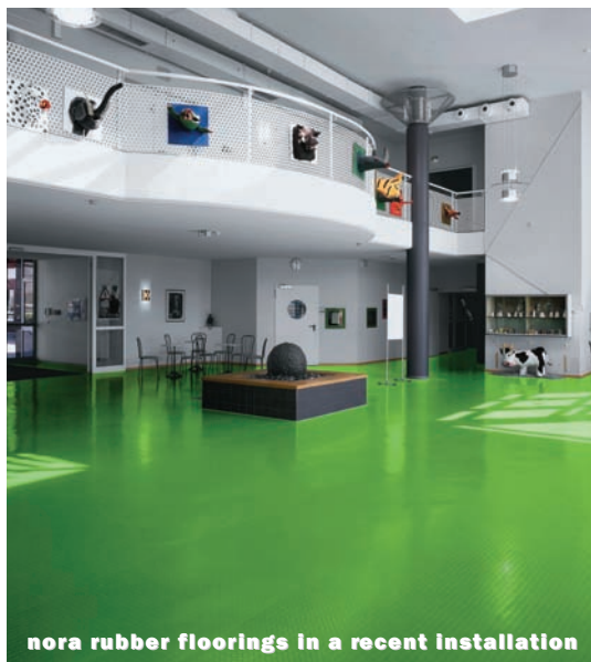
nora rubber floorings in a recent installation

Rubber Flooring Online has launched Apex rubber floor tiles from only £23/sq m in a range of colours and profiles. A free sample service is offered and free next day delivery. www.rubberflooringonline.co.uk