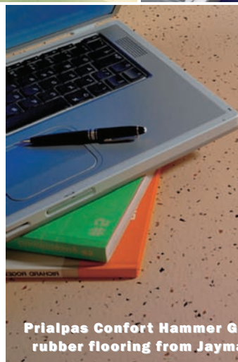
Prialpas Confort Hammer Grain rubber flooring from Jaymart

AltroMondofutura (left) and Mondopave (right) shown in recent installations