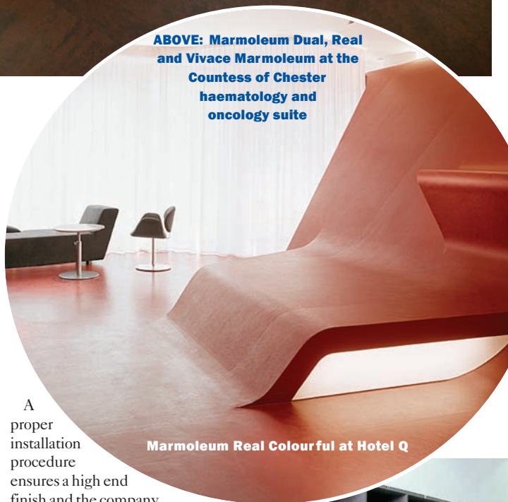
ABOVE: Marmoleum Dual, Real and Vivace Marmoleum at the Countess of Chester haematology and oncology suite

These design-led flooring collections are supported by a range of through-the-floor system solutions for common problems. If you need to reduce impact sound, to install a floor on a difficult surface, to control static or want a completely sustainable solution, Forbo claims to have the answer.