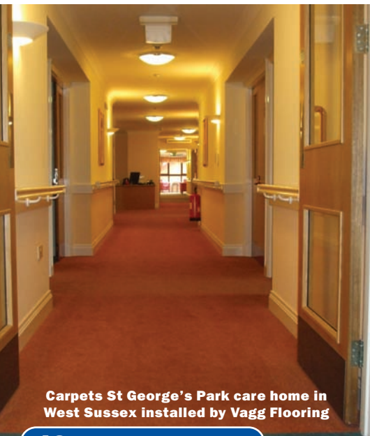
Carpets St George's Park care home in West Sussex installed by Vagg Flooring

CFJ T: 01903 240413 www.vaggflooring.com