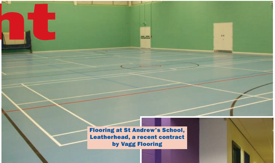
Flooring at St Andrew's School, Leatherhead, a recent contract by Vagg Flooring

'Our management team is amongst the best in