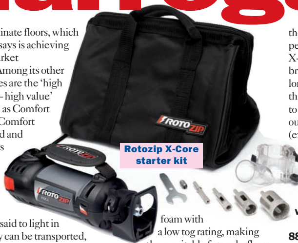
Rotozip X-Core starter kit

All the company's underlays are said to light in weight so they can be transported, carried and installed with minimal logistical or H&S considerations, and are made using polyethylene