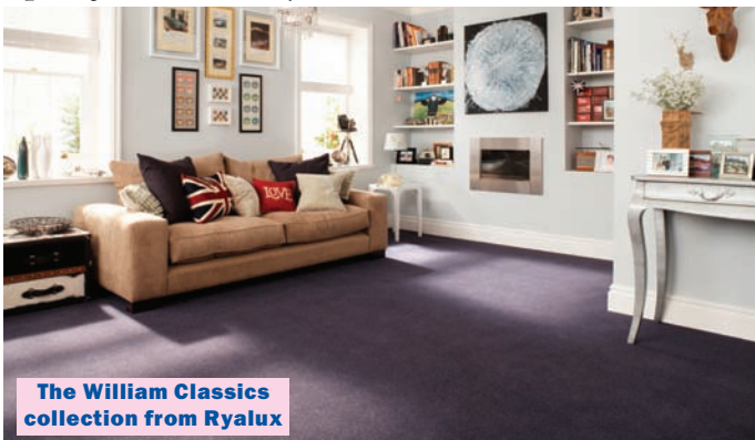
The William Classics collection from Ryalux