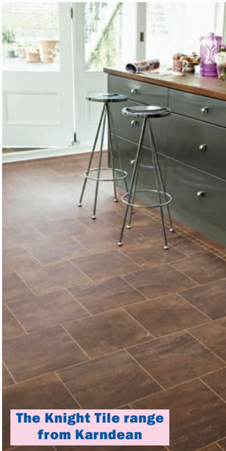
The Knight Tile range from Karndean

Karndean (T: 01386 820104) will celebrate the 12th year of its flagship Knight Tile range with the launch of 12 new products, including oak and stone designs. The designs are described as modern and neutral, with one of the new products already being selected to appear in the 'Top 10' feature at the show.