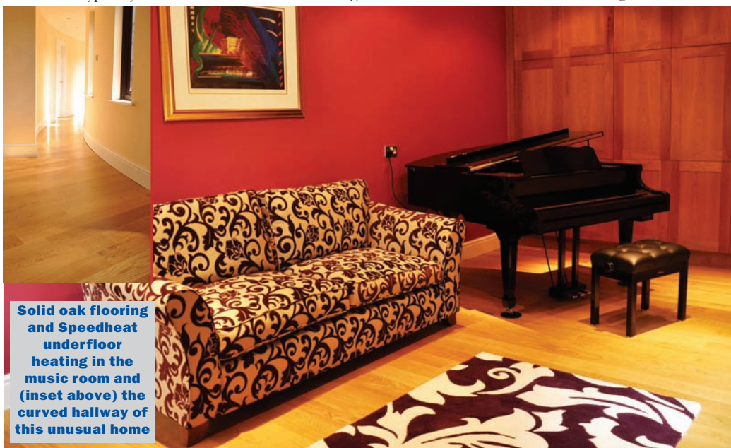
Solid oak flooring and Speedheat underfloor heating in the music room and (inset above) the curved hallway of this unusual home